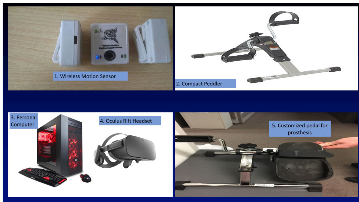
Figure 1. Illustration of the virtual reality treatment hardware, consisting of a motion sensor, bicycle pedaler, computer, Oculus headset, and prosthetic pedal.